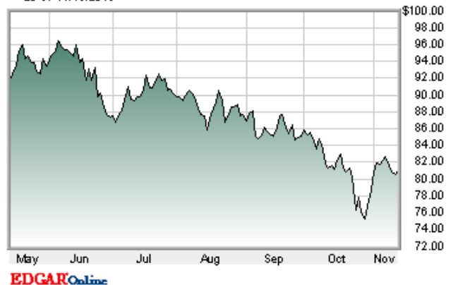
RELIANCE STEEL & ALUMINUM CO as of 11/13/2018