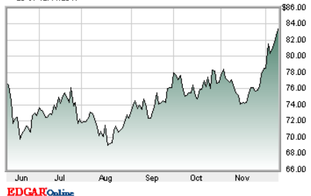
RELIANCE STEEL & ALUMINUM CO as of 12/11/2017